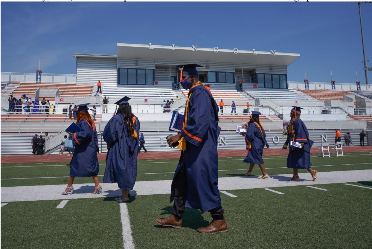
Lincoln University graduates at the Class of 2020 commencement ceremony.