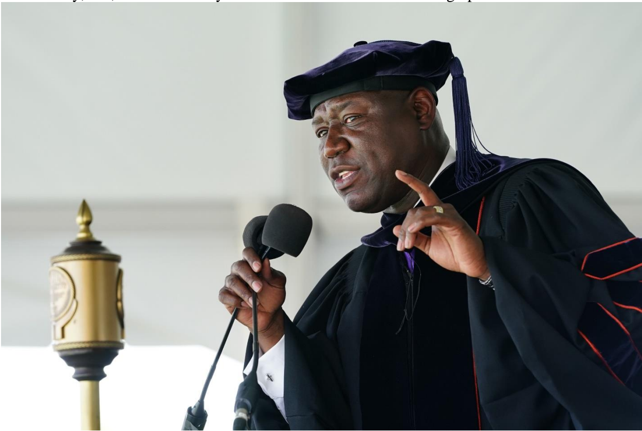
Benjamin Lloyd Crump, the commencement Speaker at the Class of 2020 commencement ceremony. Crump is a renowned civil rights and personal injury attorney who has established himself as one of the nation's foremost lawyers and advocates for social justice. In 2020 he became the attorney for the families of Ahmaud Arbery, Breonna Taylor, George Floyd, and Jacob Blake. Read more