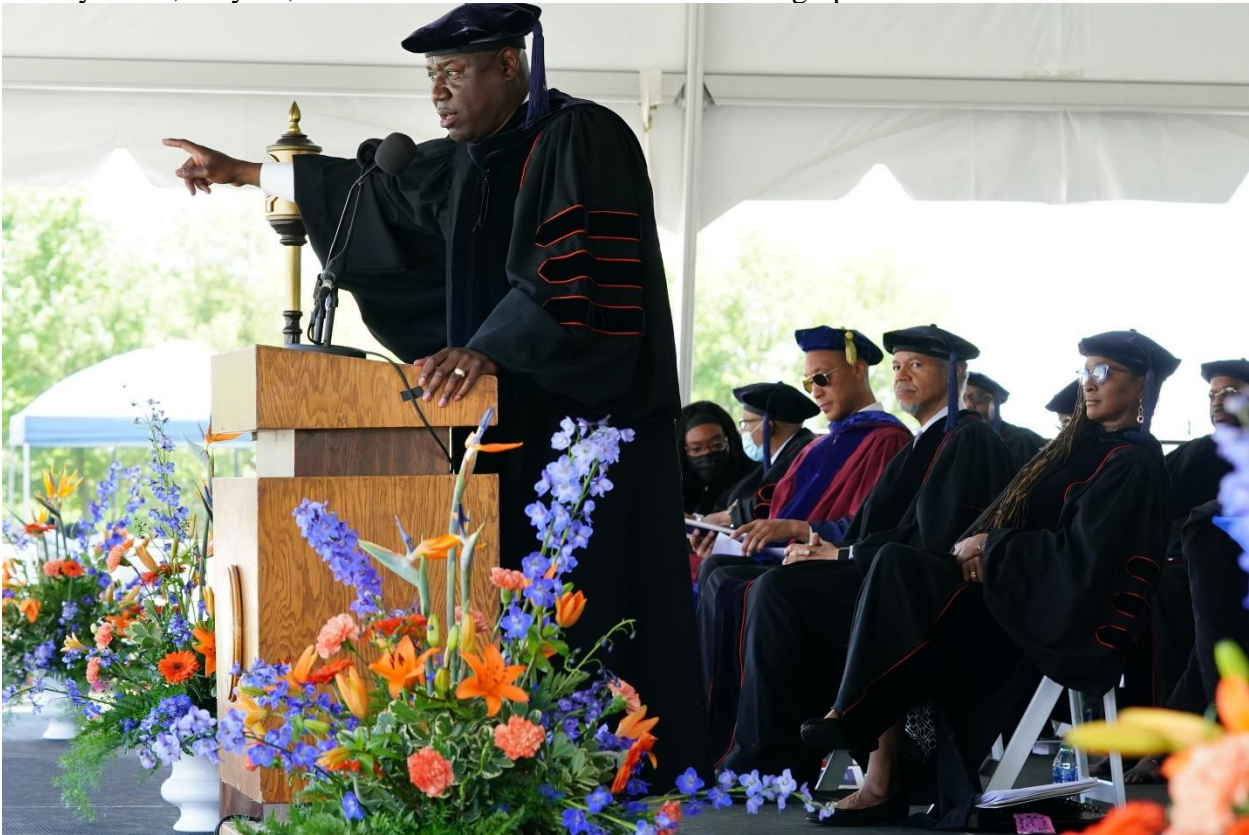
Benjamin Lloyd Crump speaks during the 2021 graduation.