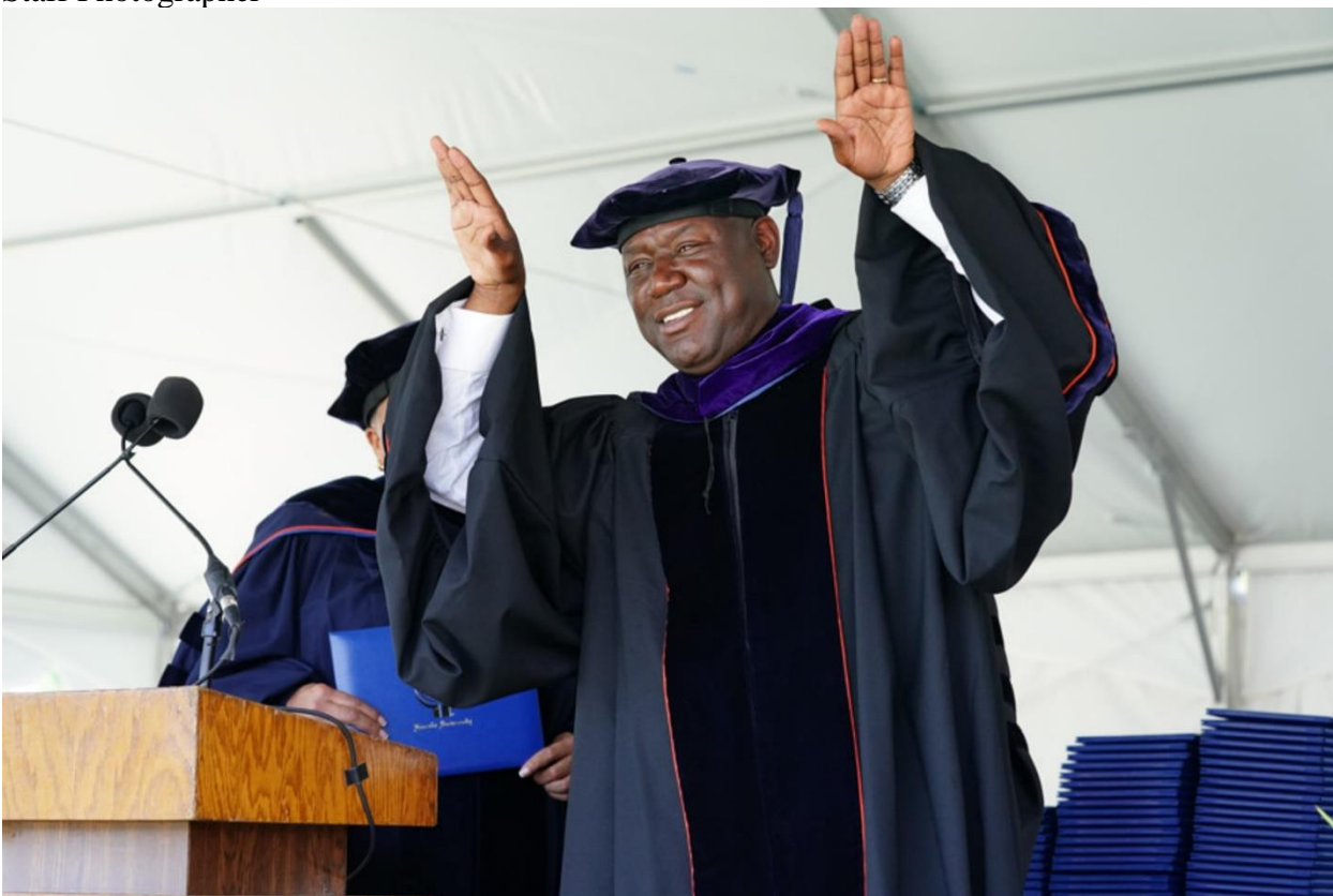
Benjamin Lloyd Crump shown here after receiving the honorary Doctor of Laws Degree.